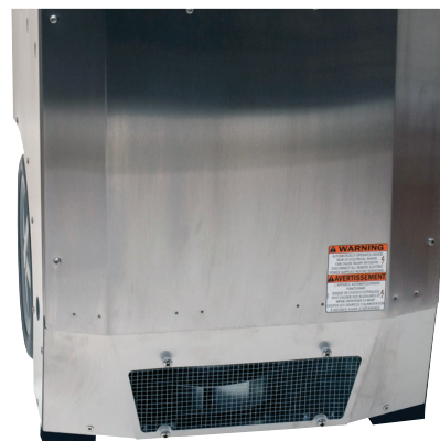
The Phoenix 270HTx features a sleek body style with chamfered corners for maneuverability in its legendary stainless steel cabinet.

Below 50°F – When the Phoenix 270HTx is used in very cool operating temperatures (below 50°F), frost will form on the evaporator coil as it dehumidifies. When enough frost forms the solid state controls will initiate a defrost cycle. The defrost cycle periodically turns off the compressor while allowing the blower to run. The automatic bypass door will remain closed in this operating range. Increased airflow and static pressure will help defrost the evaporator more quickly and efficiently.