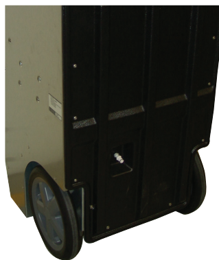
A skidplate protects the Phoenix 270HTx from damage while loading and unloading, and in transport.